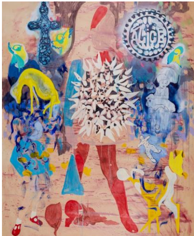
Alexis Soul-Gray Happy Birthday Alice, 2024